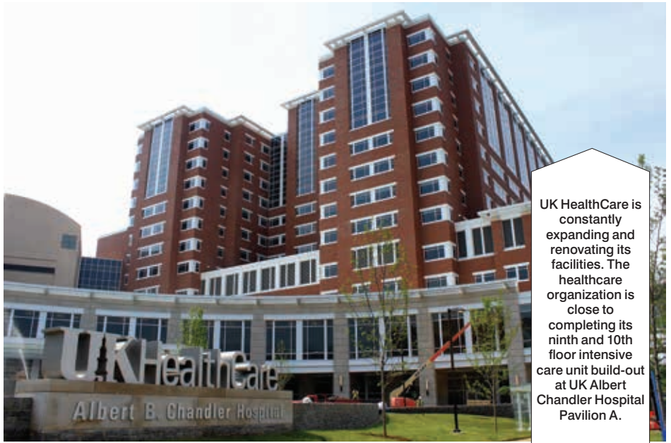
UK HealthCare is constantly expanding and renovating its facilities. The healthcare organization is close to completing its ninth and 10th floor intensive care unit build-out at UK Albert Chandler Hospital Pavilion A.

Lexington is the second largest metropolitan area in the beautiful and historical state of Ken-